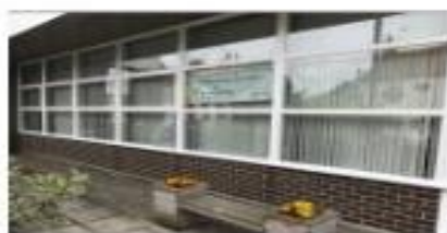
Location 1 Viewed from the right

PS. UNABLE TO PHOTOGRAPH EXISTING WINDOW (LOCATION 1) FACE ON AS SHUBBERY IS BLOCKING THE VIEW.