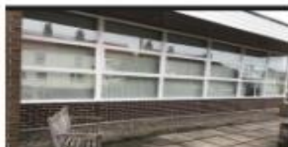
Location 1 Viewed from the left

IMAGES OF EXISTING WOODEN WINDOW FRAMES AND OPENING LIGHTS TO BE REPLACED WITH D/GLAZED UNITS OF EXACTLY THE SAME PROFILE