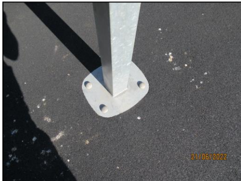
(Exposed ground fixing in impact area – library photo)