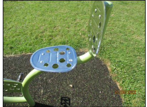
(Hard edge at seat backrest – library photo)