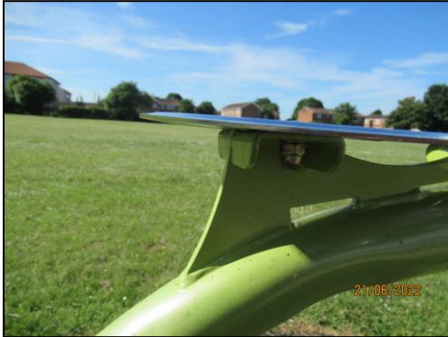
(Hard edge at seat – library photo)