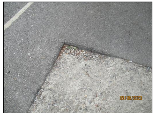
(Potential trip hazard in goal)