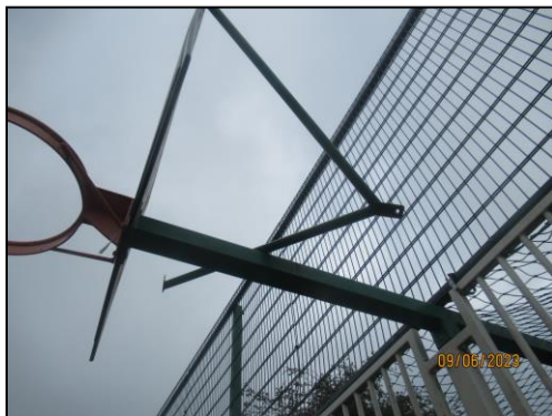
(Loose basketball back board frame)