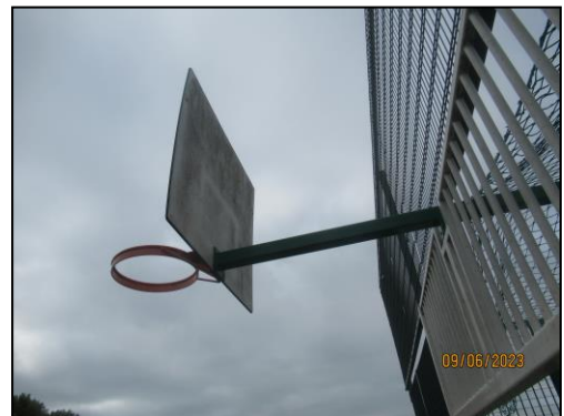
(Missing basketball back board frame)