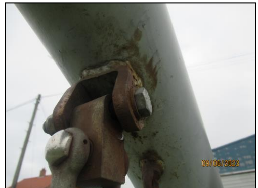
(Worn bushes in chain bearing blocks)