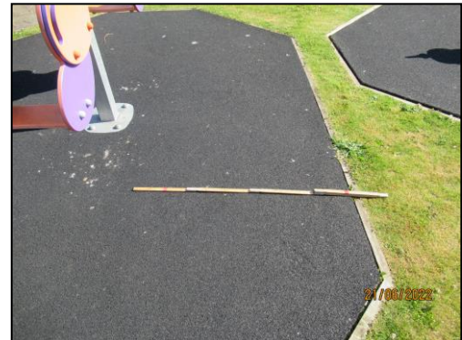
(Edgings in impact area – library photo)