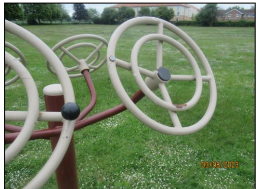
(Missing hand holds at hand wheels)