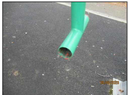
(Missing end cap on foot hold)