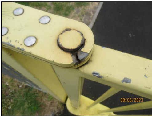
(Broken hinge at gate)