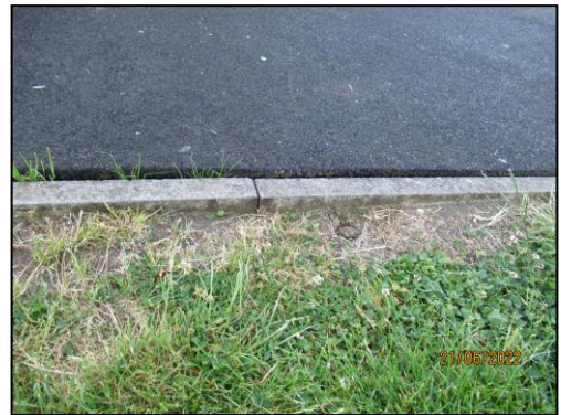
(Potential trip hazard at edgings – library photo)